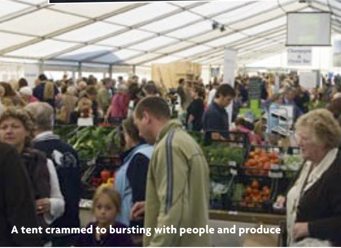
A tent crammed to bursting with people and produce