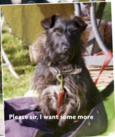
Please sir, I want some more