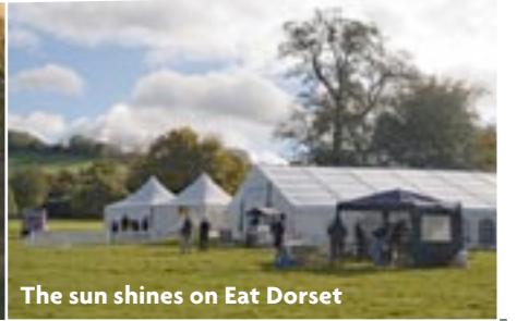
The sun shines on Eat Dorset