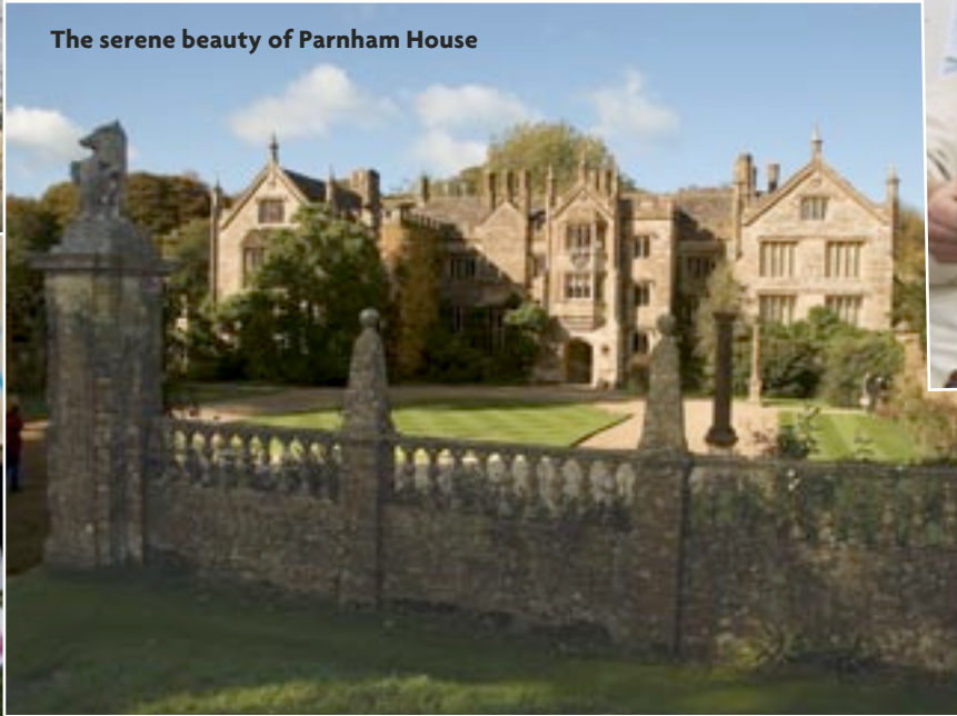
The serene beauty of Parnham House